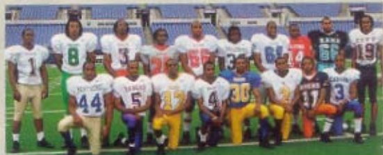
Players from the 18 schools modeled the new uniforms.